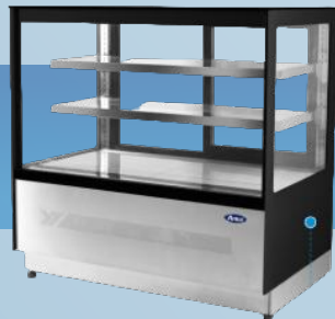
WDF097F WDF127F WDF157F WDF177F