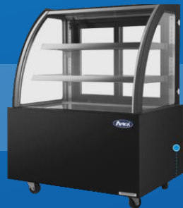
WDG096D WDG126D WDG156D WDG186D