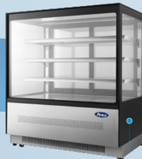
WDZ097Z WDZ127Z WDZ157Z WDZ177Z