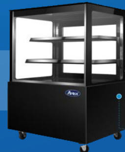
WDG096F WDG126F WDG156F WDG186F